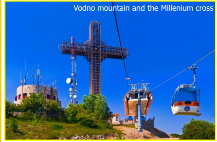
Vodno mountain and the Millenium cross